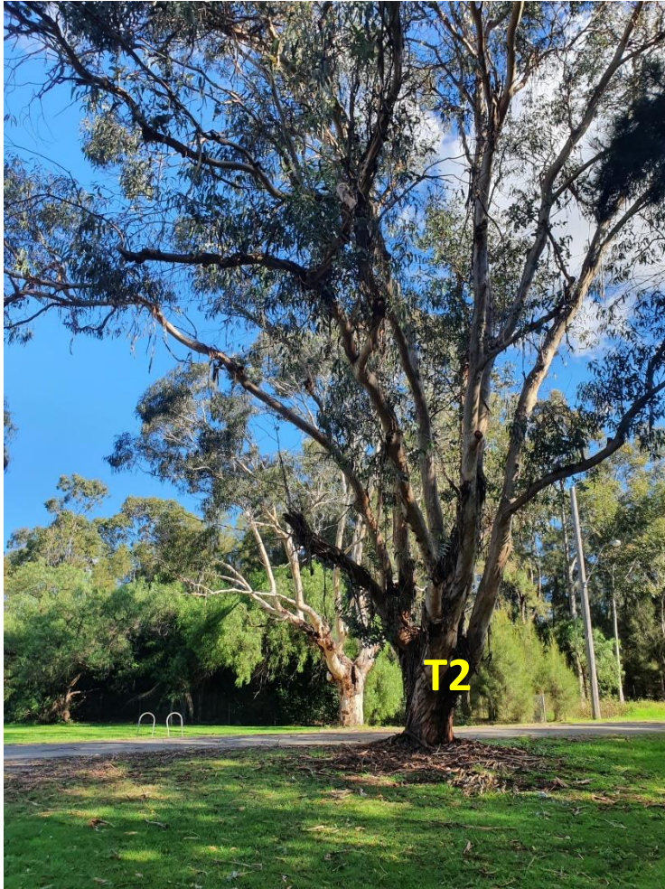
Image 3: Tree 2 located in development footprint for proposed cul-de-sac.