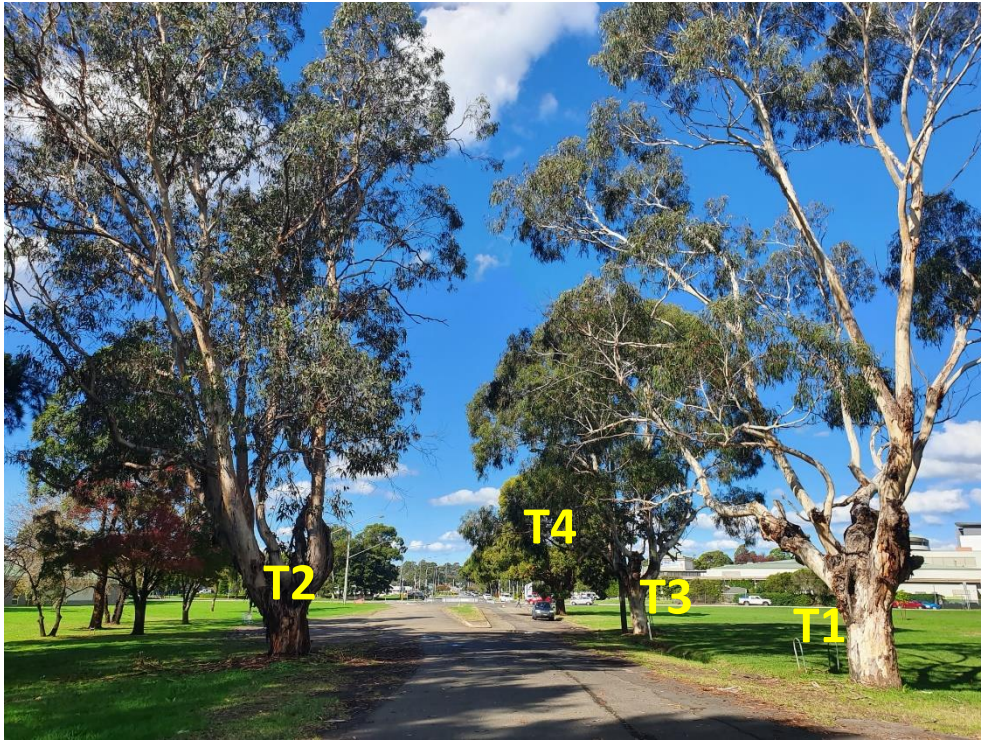
Image 1: Trees 1 to be removed for driveway access to site, Tree 2 to be removed to accommodate cul-de-sac. Trees 3 and 4 to be removed.