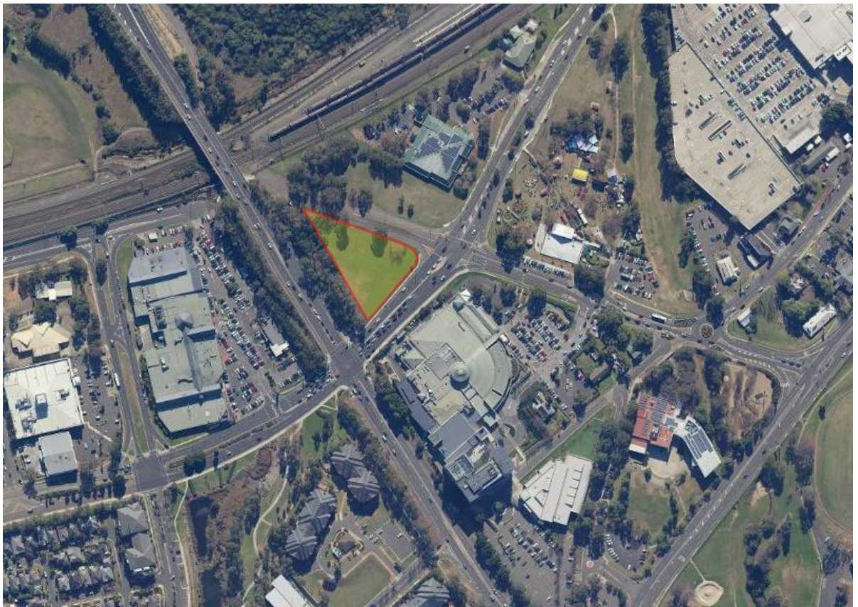
Fig 1: Aerial image (SIX Maps, accessed -4 th June 2021) showing site.